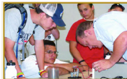
SAME: Learning by Doing