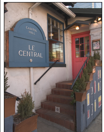
Le Central, Location of SWE-RMS Awards Brunch

Invitations will be mailed in April and will include more details. Please RSVP to Chris Tippett at chris.tippett@merrick.com .